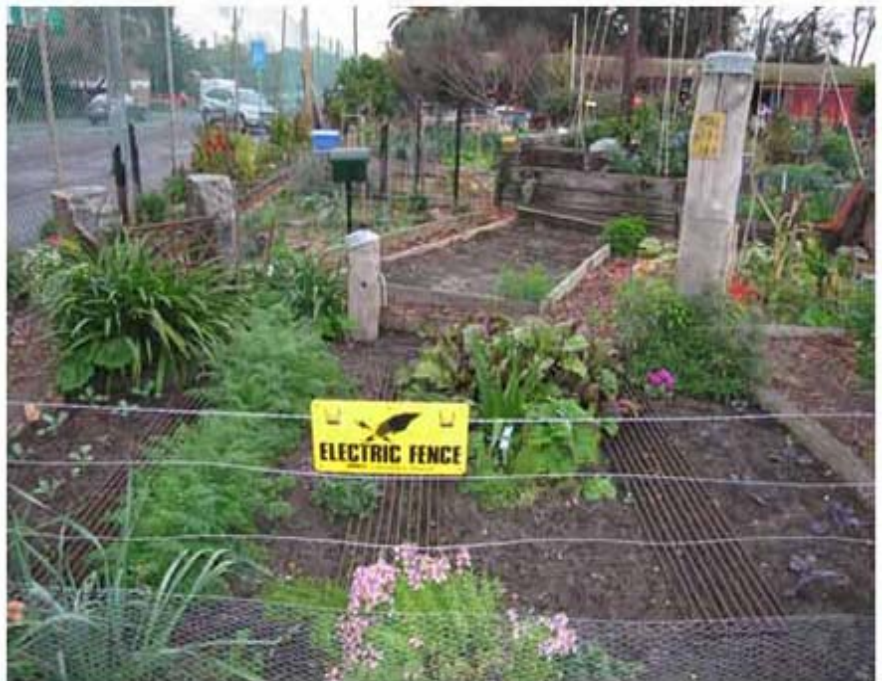
Image 3 Community Garden

Opportunities for social interaction in a local community are a key to community spirit and the mental health of residents. A simple facility like a community Laundromat can be an important meeting place and focus for community life. Other facilities include children's playgrounds, community gardens, meeting room/hall, local shop, a basketball ring, skating facilities for teenagers.