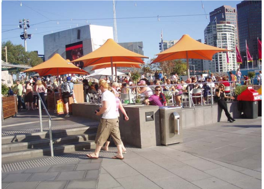
Image 4 Federation Square Melbourne, a meeting place for people

For more information, visit www.planning.com.au/vic and www.heartfoundation.com.au/sepavic