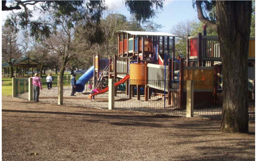
Image 2. Local park

A neighborhood park is another key local amenity providing not only an opportunity to exercise and stretch, for children’s play and ball games, relaxation in the open air, family gatherings. Tree plantings are a feature of parks and food trees (fruits and nuts) could be planted providing not only the usual greenery, and shade but also a source of fresh food. The provision of water drinking fountains should also be an essential feature of public parks as well as seats, public toilets and other amenities. The provision of public toilets is important if older members of the community are to be encouraged to be more physically active (along with the provision of seats along walking routes and paths).