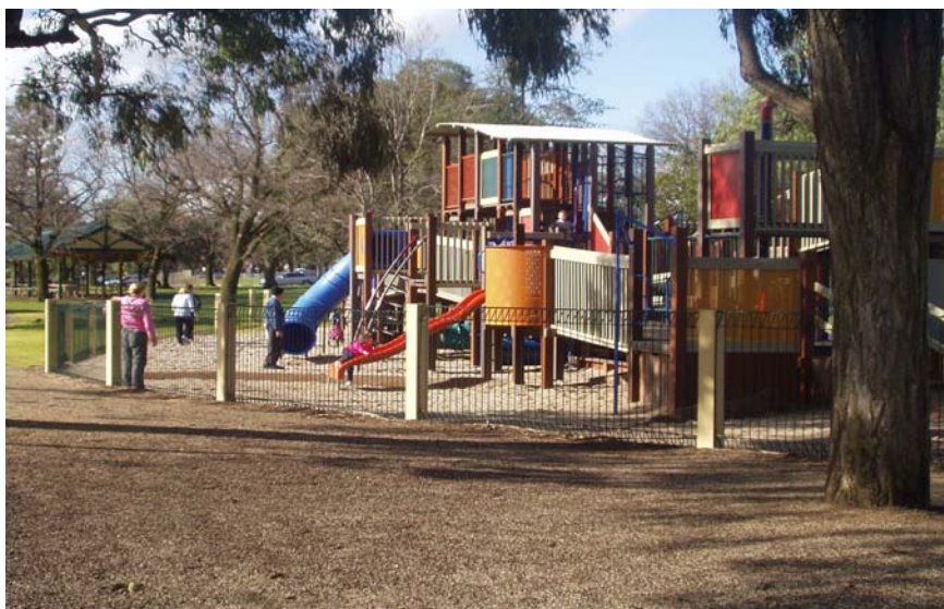
Image 2. Local park

A neighborhood park is another key local amenity providing not only an opportunity to exercise and stretch, for children’s play and ball games, relaxation in the open air, family gatherings. Tree plantings are a feature of parks and food trees (fruits and nuts) could be planted providing not only the usual greenery, and shade but also a source of fresh food. The provision of water drinking fountains should also be an essential feature of public parks as well as seats, public toilets and other amenities. The provision of public toilets is important if older members of the community are to be encouraged to be more physically active (along with the provision of seats along walking routes and paths).